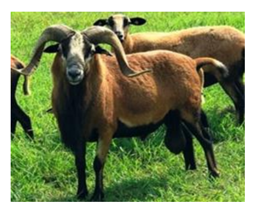
Figure 3: American Blackbelly ram