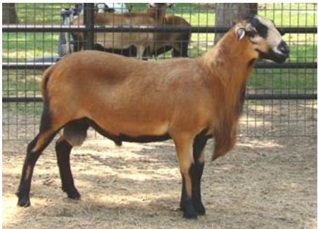
Figure 4: Martinik ram - (USOM, 2008)

creation, the Martinik sheep breed includes animals of various coats, but with very similar abilities. The adult sheep weighs on average from 35 to 45 kg and the rams from 50 to 70 kg, according to the conditions of breeding. The height at the withers for ewes is around 55cm. The small ears are borne horizontally and the tail is of medium length (above the hock); fertility is 85% and productivity 1.9 (USOM, 2008). Well-fed adult Martinik sheep are generally strong enough not to require anthelmintic treatment, with the exception of a few ewes around lambing, with litters of two or more lambs. Recent comparisons with woolen breeds have also demonstrated higher genetic resistance to parasites in Martinik lambs, making them an interesting breed for valorizing tropical pastures (INRA, 2014).