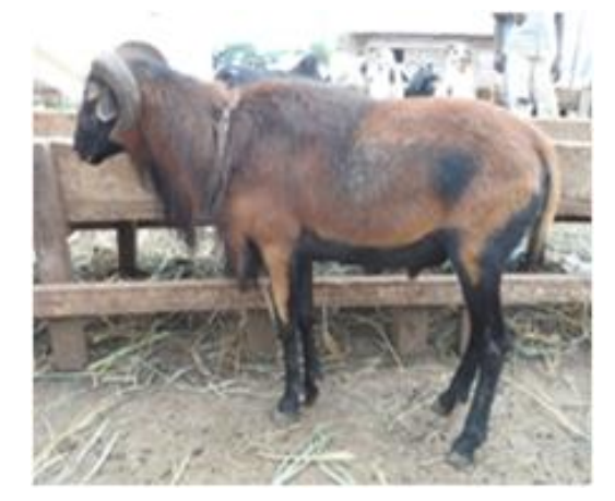
Figure 1: Cameroon Blackbelly young ram

populations in tsetse-infested areas of West and Central Africa; south of the 14th<sup>o</sup> parallel (FAO, 1992). These sheep would come from Fouta Diallon in Guinea (hence the origin of the name Djallonke) and would have for ancestor, the Egyptian sheep Ovis longipes (Devendra and McLeroy, 1982). The most commonly encountered coat patterns are black, black-legged and more rarely white, red, red-legged (Figure 1). In certain regions (particularly in the East of Cameroon), there are animals with a particular tawny coat with belly and legs colored black, which gives them the name of Blackbelly in English (Vallerand and Branckaert, 1975). The Blackbelly sheep is a breed with a fine (smooth) tail, the head is small with a straight profile. The ears are small and slightly drooping (Manjeli et al., 1991). It can reach 55 to 65 cm at the withers. This sub-race is genetically stable and the animals have a more advantageous external appearance. This impression is confirmed by their average weight, which in adult females of this sub-breed exceeds 28 kg (Vallerand and Branckaert, 1975). In Cameroon the Blackbelly sheep is used only for the production of meat, the male can reach 25 to 35kg. Nevertheless, the production of Cameroon's Blackbelly sheep milk is appreciable, ranging from 2.95 to 3.52 liters per week (Manjeli et al., 1991).