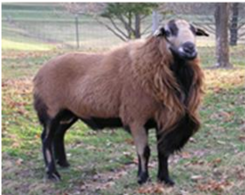
Figure 2: Barbados Blackbelly ram

the Barbados Island during the period of colonization of the island by the Europeans. Combs (1979) has established that during the first quarter of the century of colonization, a batch of Blackbelly sheep was set up on the island following British colonization in 1627. This sheep adapted to this climate during the exchanges of the slave trade has medium and horizontal ears. It is called Barbados blackbelly with reference to Barbados which is at the origin of its expansion (Shelton et al., 1990). The pattern of Blackbelly color, which seems to be simply inherited, is found in the current populations of Djallonke type sheep in West Africa. This observation, and several other features that the breed shares with the West African sheep, including the shape and size of the ear, of course, the hair (Figure 2), indicates a West African origin for the Barbados Blackbelly sheep breed. However, the latter has two distinctive features, namely: a larger average size of all "West African" populations, and higher prolificacy (Fitzhugh and Bradford, 1980). It is a larger sheep than Cameroon sheep and is generally used for meat production. Ewes raised from 1972 to 1977 at three locations in Barbados produced 1079 litters of milk, with 2194 lambs, an average of 2.03 lambs per litter, and at an average lambing interval of 8.48 months. Rastogi et al (1980) observed 26.8% single birth, 47.3% twins, 22.1% triplets, 3.4% quadruplets and 0.4% quintuplets.