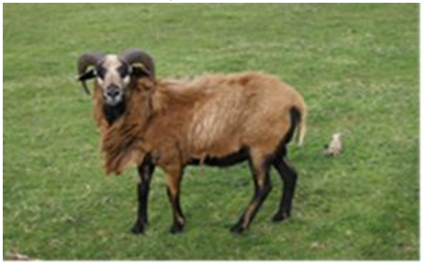
Figure 5: Kamerun schafe ram

Animals slaughtered between 5 and 8 months for about 10-16 kg of meat. The meat has a taste and appearance similar to that of game meat such as the usual lamb meat. The exquisite taste is not lost even in the slaughter of old animals.