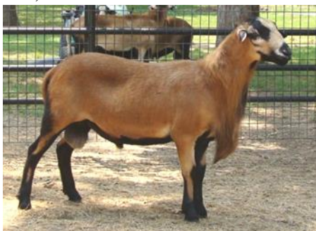
Figure 4: Martinik ram - (USOM, 2008)

creation, the Martinik sheep breed includes animals of various coats, but with very similar abilities. The adult sheep weighs on average from 35 to 45 kg and the rams from 50 to 70 kg, according to the conditions of breeding. The height at the withers for ewes is around 55cm. The small ears are borne horizontally and the tail is of medium length (above the hock); fertility is 85% and productivity 1.9 (USOM, 2008). Well-fed adult Martinik sheep are generally strong enough not to require anthelmintic treatment, with the exception of a few ewes around lambing, with litters of two or more lambs. Recent comparisons with woolen breeds have also demonstrated higher genetic resistance to parasites in Martinik lambs, making them an interesting breed for valorizing tropical pastures (INRA, 2014).