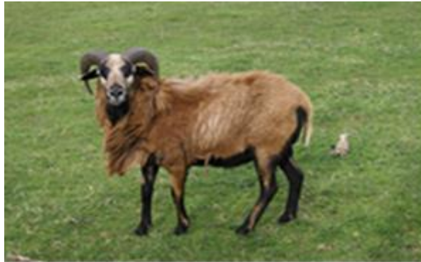
Figure 5: Kamerun schafe ram

Animals slaughtered between 5 and 8 months for about 10-16 kg of meat. The meat has a taste and appearance similar to that of game meat such as the usual lamb meat. The exquisite taste is not lost even in the slaughter of old animals.