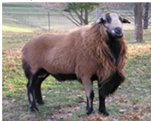
Figure 2: Barbados Blackbelly ram

the Barbados Island during the period of colonization of the island by the Europeans. Combs (1979) has established that during the first quarter of the century of colonization, a batch of Blackbelly sheep was set up on the island following British colonization in 1627. This sheep adapted to this climate during the exchanges of the slave trade has medium and horizontal ears. It is called Barbados blackbelly with reference to Barbados which is at the origin of its expansion (Shelton et al., 1990). The pattern of Blackbelly color, which seems to be simply inherited, is found in the current populations of Djallonke type sheep in West Africa. This observation, and several other features that the breed shares with the West African sheep, including the shape and size of the ear, of course, the hair (Figure 2), indicates a West African origin for the Barbados Blackbelly sheep breed. However, the latter has two distinctive features, namely: a larger average size of all "West African" populations, and higher prolificacy (Fitzhugh and Bradford, 1980). It is a larger sheep than Cameroon sheep and is generally used for meat production. Ewes raised from 1972 to 1977 at three locations in Barbados produced 1079 litters of milk, with 2194 lambs, an average of 2.03 lambs per litter, and at an average lambing interval of 8.48 months. Rastogi et al (1980) observed 26.8% single birth, 47.3% twins, 22.1% triplets, 3.4% quadruplets and 0.4% quintuplets.