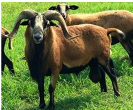
Figure 3: American Blackbelly ram