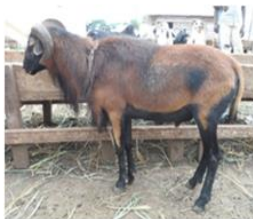
Figure 1: Cameroon Blackbelly young ram

populations in tsetse-infested areas of West and Central Africa; south of the 14th° parallel (FAO, 1992). These sheep would come from Fouta Djallon in Guinea (hence the origin of the name Djallonke) and would have for ancestor, the Egyptian sheep Ovis longipes (Devendra and McLeroy, 1982). The most commonly encountered coat patterns are black, black-legged and more rarely white, red, red-legged (Figure 1). In certain regions (particularly in the East of Cameroon), there are animals with a particular tawny coat with belly and legs colored black, which gives them the name of Blackbelly in English (Vallerand and Branckaert, 1975). The Blackbelly sheep is a breed with a fine (smooth) tail, the head is small with a straight profile. The ears are small and slightly drooping (Manjeli et al., 1991). It can reach 55 to 65 cm at the withers. This sub-race is genetically stable and the animals have a more advantageous external appearance. This impression is confirmed by their average weight, which in adult females of this sub-breed exceeds 28 kg (Vallerand and Branckaert, 1975). In Cameroon the Blackbelly sheep is used only for the production of meat, the male can reach 25 to 35kg. Nevertheless, the production of Cameroon's Blackbelly sheep milk is appreciable, ranging from 2.95 to 3.52 liters per week (Manjeli et al., 1991).